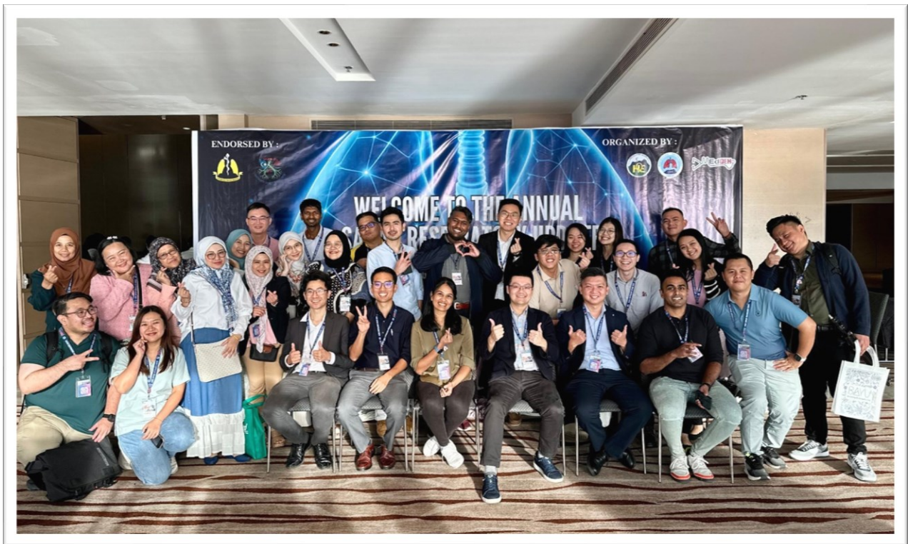
Sabah Respiratory Update 2025 organizing committee

Senior Lecturer, Universiti Malaysia Sabah