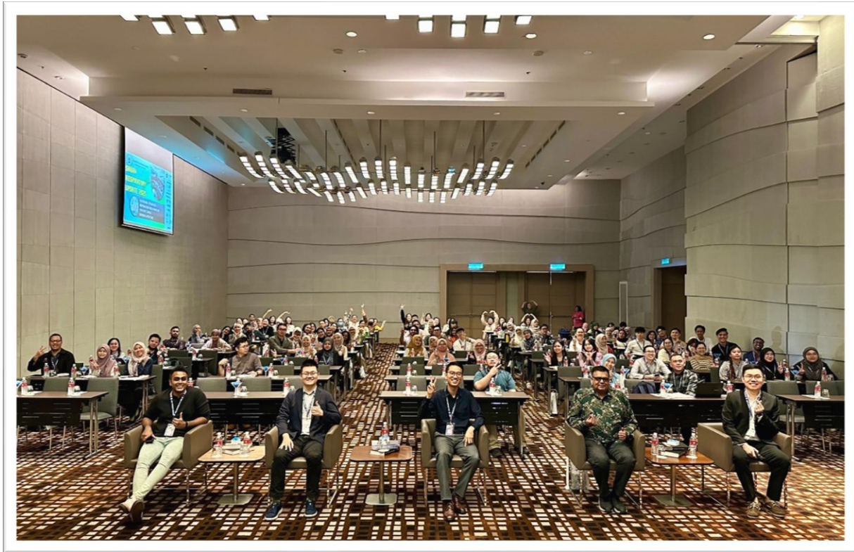
Group picture with physical attendees of Sabah Respiratory Update 2025

The QEH Sabah Respiratory Update was held on 11 th May 2025 at Marriot Hotel, Kota Kinabalu, Sabah. The event was organized by the Department of Respiratory Medicine, QEH, and endorsed by the Malaysian Thoracic Society (MTS) and the Malaysian Association of Bronchology and Interventional Pulmonology (MABIP). The chosen theme for this year was “Mastering the Basics”, as we wanted to emphasise the importance of basic principles in respiratory care, especially in primary care.